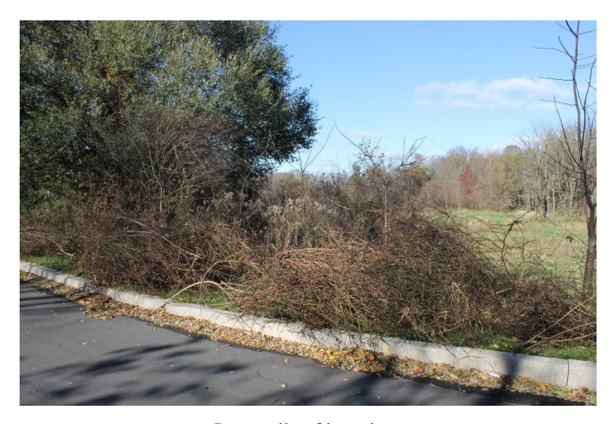
Large pile of invasives