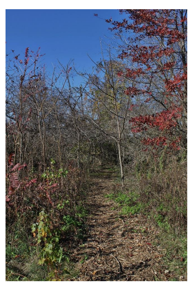
A newly finished section of trail