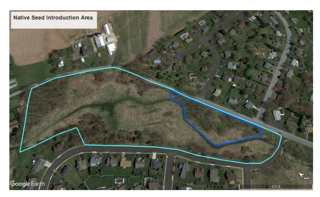
Native Seed Introduction Areas