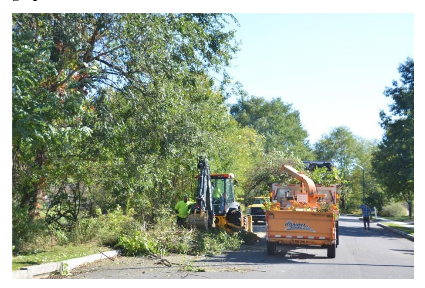
Invasive plant removal in partnership with Upper Allen Township