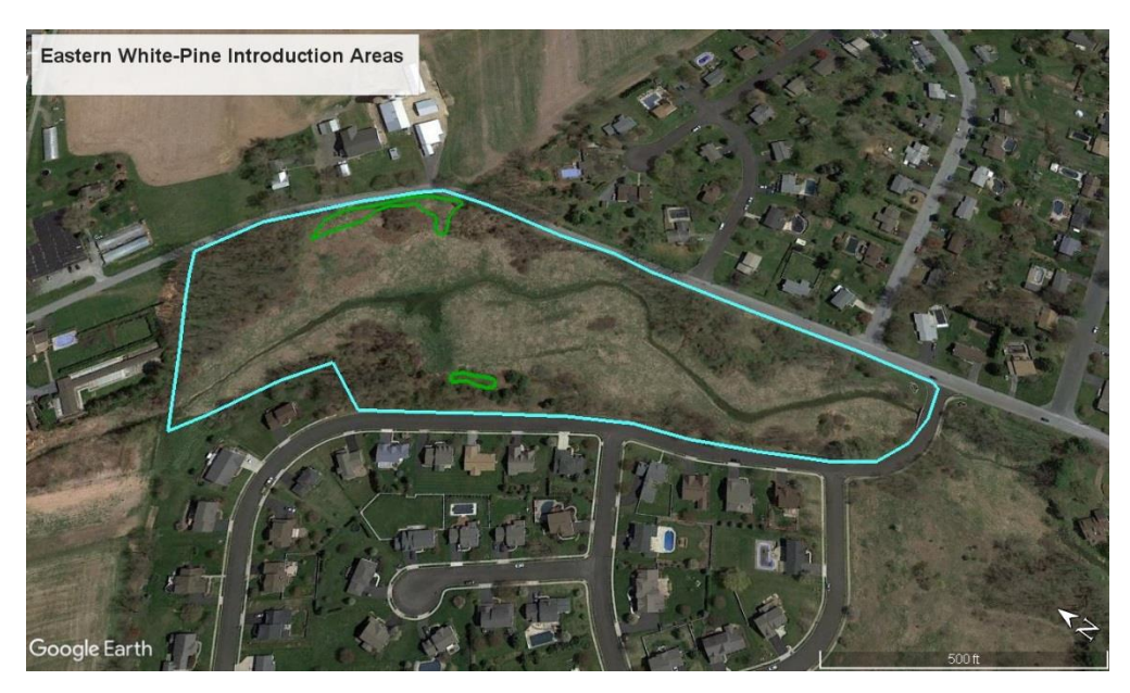
White-Pine Introduction Areas