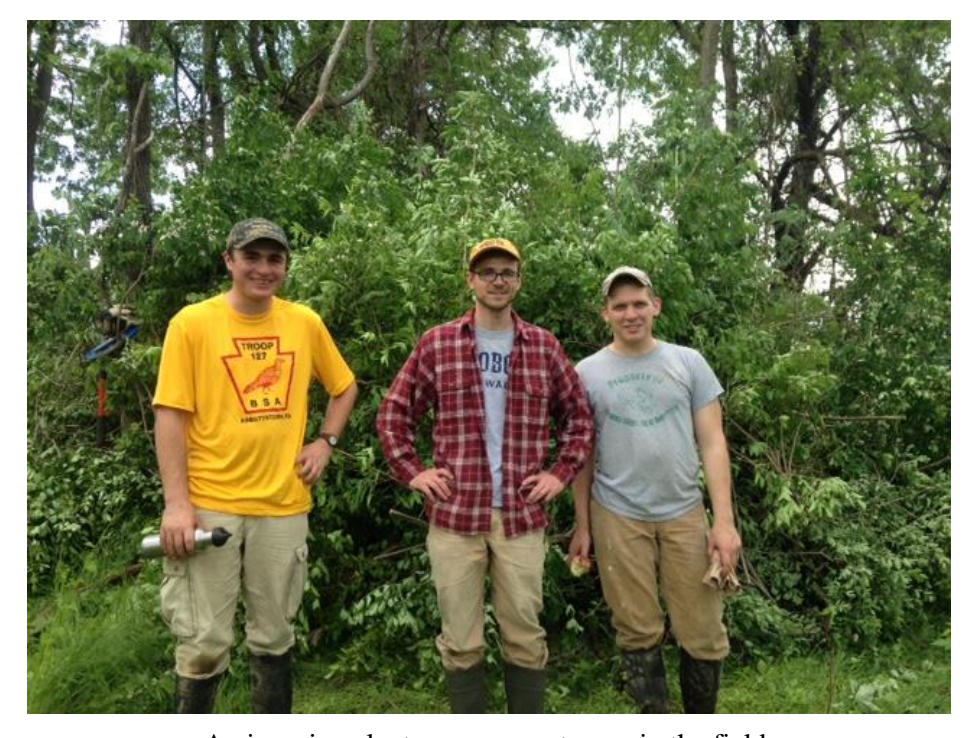
An invasive plant management crew in the field