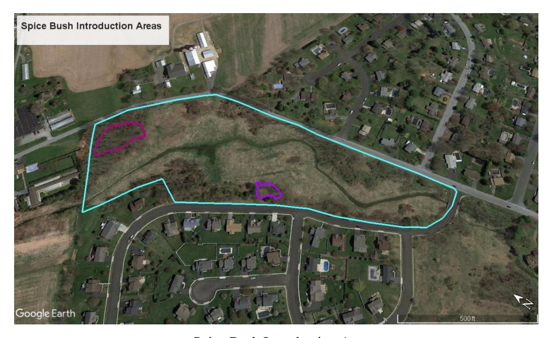
Spice Bush Introduction Areas