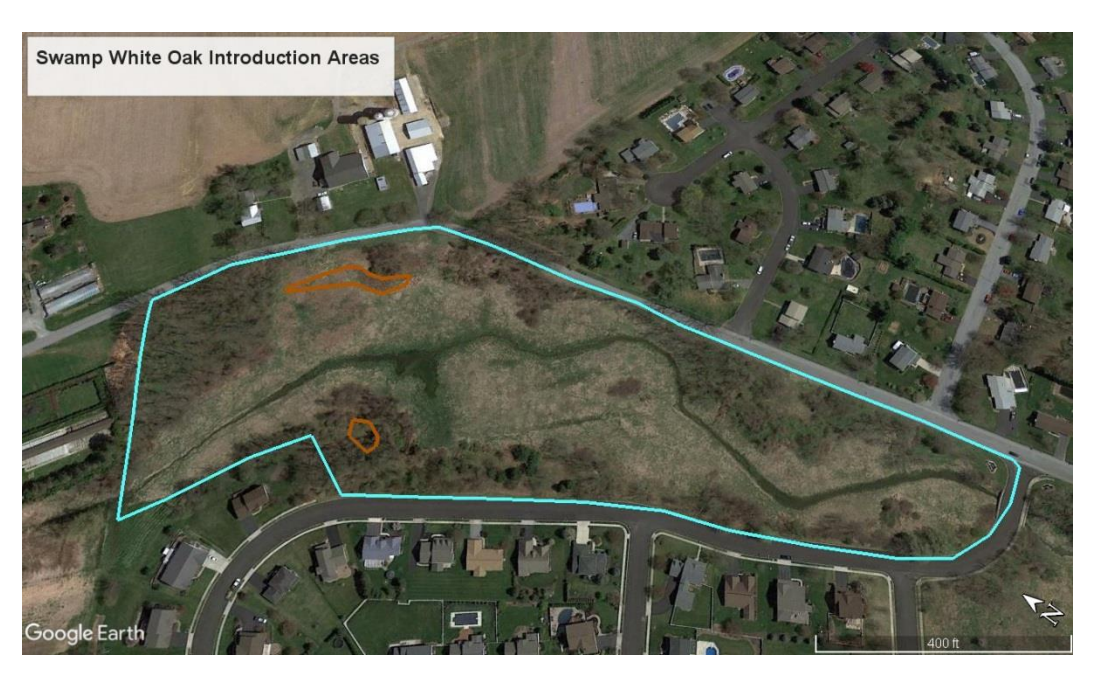
Swamp White Oak Introduction Areas