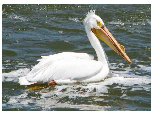
The huge beak of the American White Pelican measures 13–14" on males and 10–13" on females.