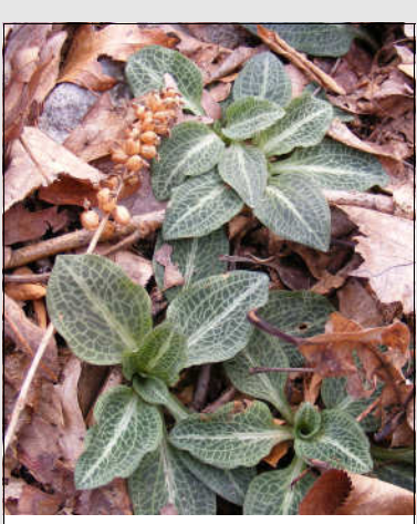
The Downy Rattlesnake Plantain is in the Orchid family. Watch for 6-18" white flowers that bloom in July-August. www.ct-botanicalsociety.org.

"To reach the gas in the Marcellus layer, drillers must bore through dozens of geological formations. Then, workers pump into the well millions of gallons of water mixed with sand, salt and a cocktail of chemicals to fracture the gas-bearing rock. This process, known as hydraulic fracturing, or "fracking," was pioneered by energy giant Halliburton in the 1940s. The gas flows from the broken rock out of the well to a compressor. With it comes about one-fifth of the water that was pumped in, bearing the chemicals used in fracking and radioactive elements that occur naturally in the rock. The remainder of the water stays deep in the formation-well below drinking water aquifers, according to regulators and energy companies.