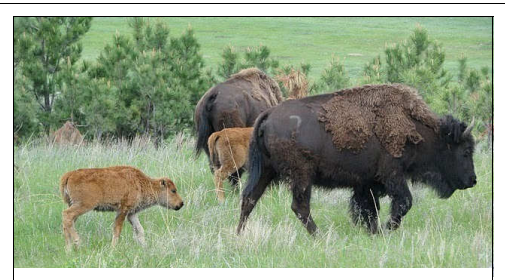
Custer State Park in South Dakota is home to 1,500 American bison, one of the largest publicly held herds in the world.

AAS monthly programs (September—May) typically take place on the 3rd Thursday of each month at the Christ Presbyterian Church, 421 Deerfield Road, in the Allendale neighborhood of Camp Hill. Join us at 7:00 pm for refreshments and conversation. The program begins at 7:30. Directions to church on back page.