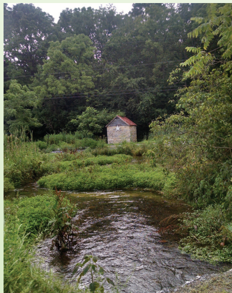
This photo shows the beauty of the Headwaters of LeTort Spring Run. If the CPC land acquisition is successful it will continue to provide much needed habitat for trout, birds and other wildlife.