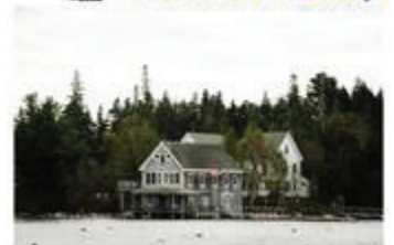
Field o' Teens.