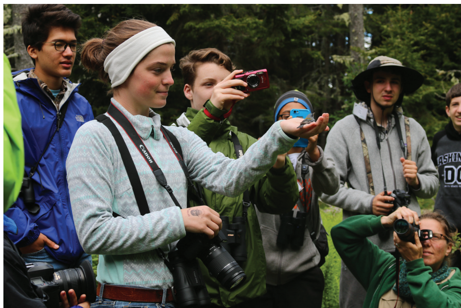
Bird banding at Hog Island

We welcome suggestions for other camps consistent with our chapter mission to be considered for our scholarship program.